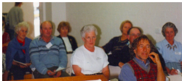
Some of the Attendees March 1996